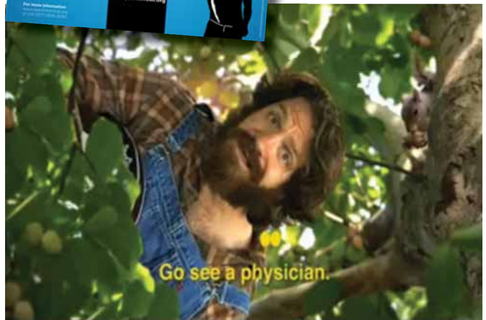
Our highly popular “Sing-A-Long” video from CarpeTestes.org

Register at www.seankimerling.org for updates. Help stop the #1 cancer in men under 40