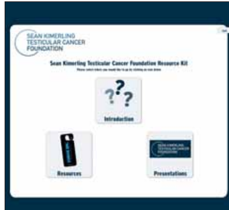
Screen shot from the resource kit.

Programs are designed to provide useful and current information on TC, and can be presented by community leaders, teachers, parents, survivors, nurses, physicians, community