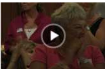
Bras, flash mob and breast cancer support Aug 16, 2011