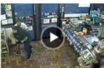
Fort Myers robbery near Pine Manor Aug 4, 2011