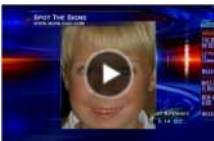
Photos Could Be Key To Noticing Eye Disease Jul 15, 2011